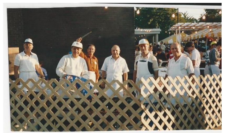
1990 AHEPA Members at the souvalaki booth