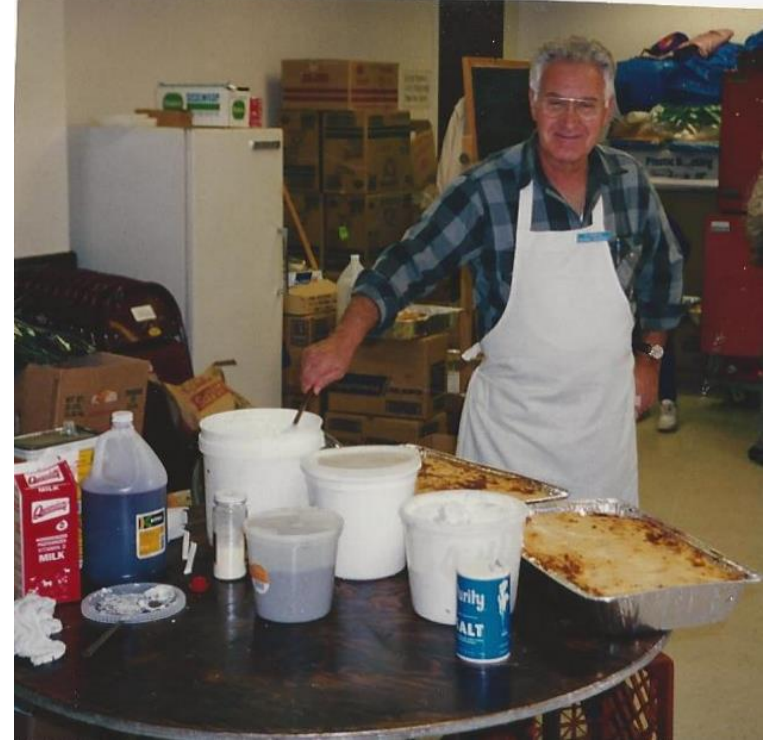
1993 Wm. Spyropoulos Day School PTA- Kafenion

There are so many pictures of our festivals... We will continue up to the present next week.