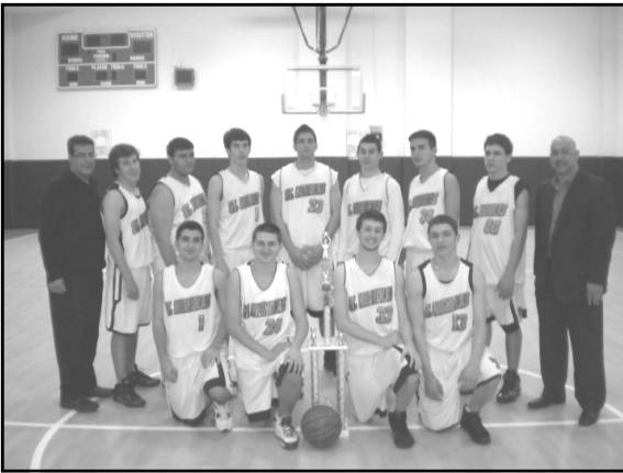
Sr. Boys Team MGobl Champs 2009-2010

All in all, March 21 st will be remember by our youth as “Championship Sunday” for years to come.